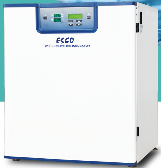
CelCulture® CO 2 Incubators available in 3 sizes, 50 L, 170 L, and 240 L.

90°C moist heat decontamination cycle, validated by HPA-UK.